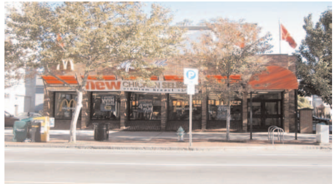
Townscape cites McDonald's in Central Square, shown above, as an example of offensive corporate branding.