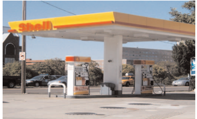
Townscape cites this Shell Station on Memorial Drive as another offender.

(The above list of goals can be found in the initiative's Executive Summary)