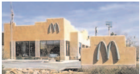
This McDonald's, located in Sedona, AZ, represents an example of a corporate image unobtrusively blending into a community.

Townscape's proposed sign ordinance amendment includes the following changes: