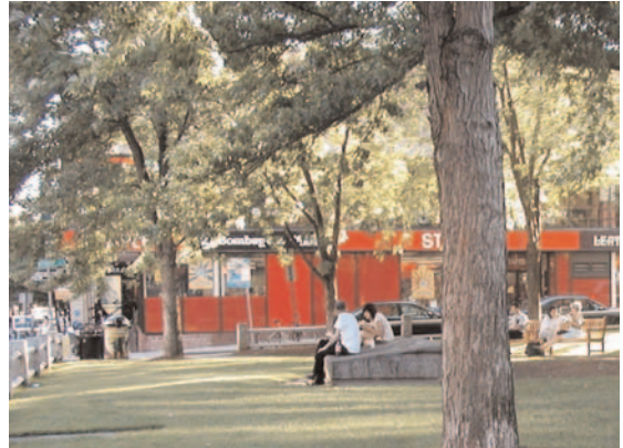
Staples on JFK St. in Harvard Square

"It's not that we don't want Staples in Harvard Square, or that we want every building to look the same; we object to the obnoxious shield of red paneling that now borders an otherwise charming park...We have focused on this example as an indication of how little ability our city currently has to regulate this advertising practice, even in a protected district."