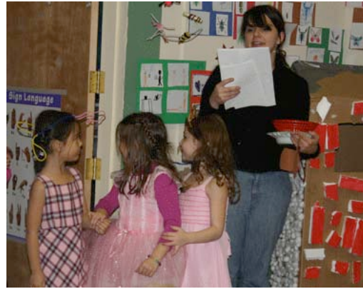
"Three Little Princesses"

Please enjoy these snapshots from the performance.