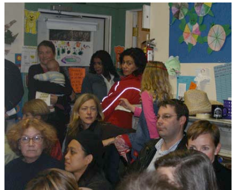
A packed house!