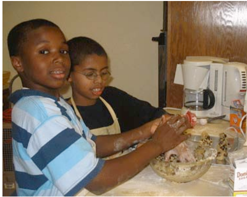
TNTS (Teachers in Training) bake cookies pre-event