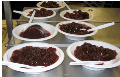
Agassiz neighbors enjoy a delicious dinner with dishes both traditional and diverse

Our 34th annual Thanksgiving Pot Luck Dinner was so well attended that food and desserts flew off the tables almost faster than we could bring them out! The Agassiz Neighborhood Council staff would like to thank all who contributed food, prep and clean up time, turkey-carving skills and good conversation. We look forward to dining with you again next year!