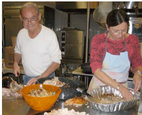
Crescent Street neighbors carve turkeys