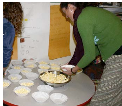
Refreshments for everyone