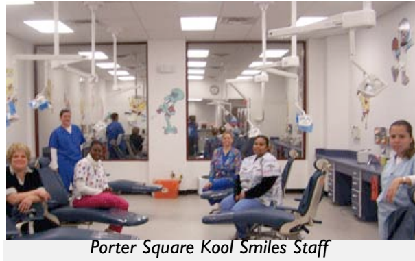
Porter Square Kool Smiles Staff

Kool Smiles also prides itself on comprehensive community outreach. In addition to operating information tables at community events, they give educational presentations and demonstrations at day cares, community schools, parenting classes, adult education/job prep courses, foster agencies, shelters, etc. to promote "good oral health habits." Because MA law prevents it from doing offsite screenings, Kool Smiles invites individuals and groups for free screenings at the office. Ms. Scogin told us, "Kids get a screenings results form and a goody bag. The staff also holds 'career days' and utilizes science experiments and believe-it-or-not type photos to interest older patients."