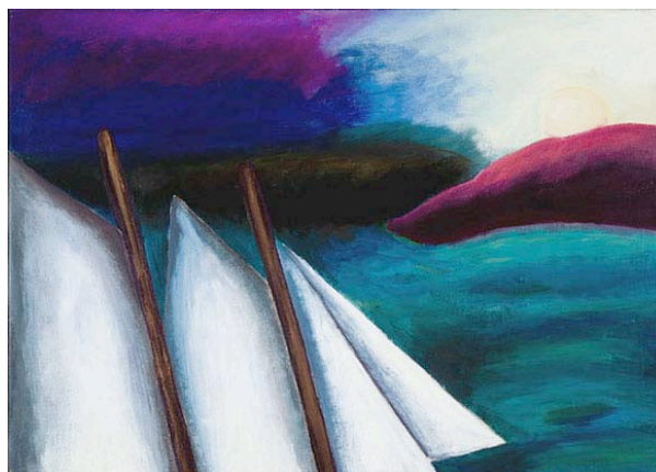
"Moonlight Sail" by Camille Saunders Musser