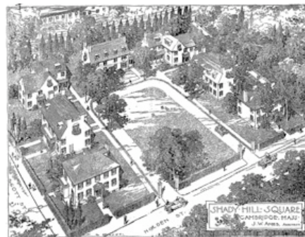
Rendering of semi-attached homes around central green

Historically, Ms. Gold explained, the green has always been in common use. A number of those who purchased properties in the 1970’s were given verbal promises that the green would remain untouched by the same family who later sold to Stonehouse. The city has only recently assessed taxes on the green. For most of its history it appears that the city, like the neighborhood, saw it as open space rather than a buildable lot.