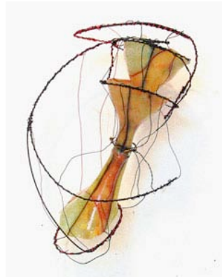
"Note in the Margin" Phyllis Ewen

Gallery Hours: M - F, 9:00 AM - 5:00 PM Saturdays, Noon - 5:00 PM