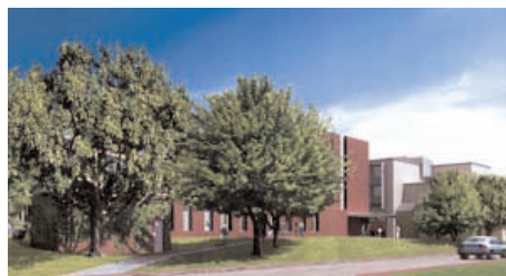
Artist rendering of landscaping along Hammond

the campus. He explained that, as a result of public dialogue about this edge of the campus prior to the project, Harvard rotated the position of the Northwest Science Building and set the building back from the street by approximately ninety feet. The set back will allow for generous landscaping on this edge of the campus. The landscape plan will also address the brick emergency egress/fire control structure that is required by state building code. The planting portion of the landscape plan is scheduled for spring of 2008.