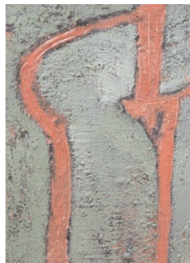
"della terra" Gina Halstead

Gallery Hours: M - F, 9:00 AM - 5:00 PM Saturdays Noon - 5:00 PM