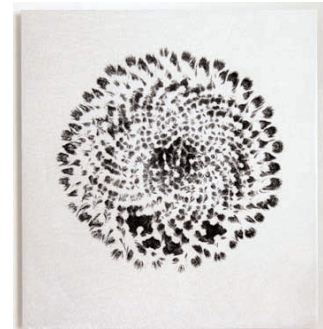
"Dwelling #5" Prilla Smith Brackett