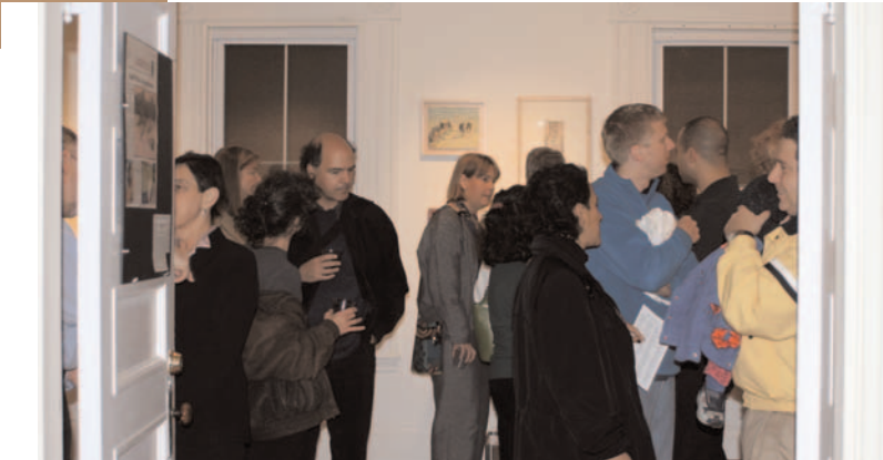
Guests peruse the selection of work by four dozen local artists.