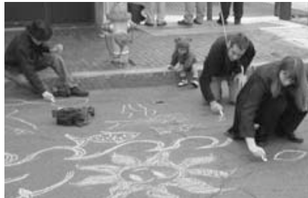
Shown are Agassiz Neighborhood Council sponsored activities for kids and families at Harvard Square Business Association's May Fair held on Sunday, May 4.

For details, volunteer opportunities or more information call your City Arborist at 617-349-6433. This information was taken from the City of Cambridge website < http://www.cambridgema.gov >.