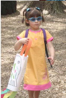
Sacramento Preschool kids create festive windsocks