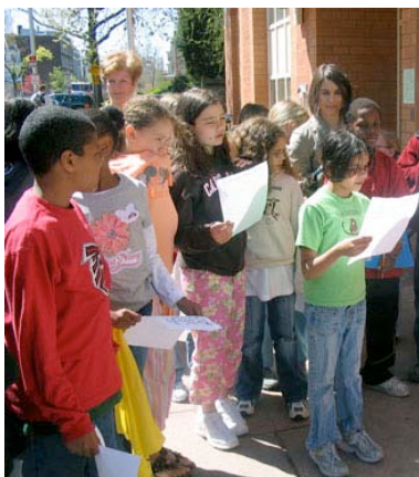
Baldwin students read poems