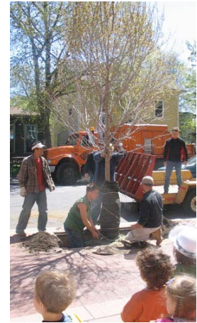
Planting the red maple