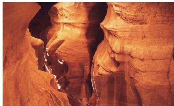
Glowing Slot by Harvey Halpern

The show runs January 15 to February 19, 2010. Gallery Hours: Weekdays 10:00 AM-5:00 PM.