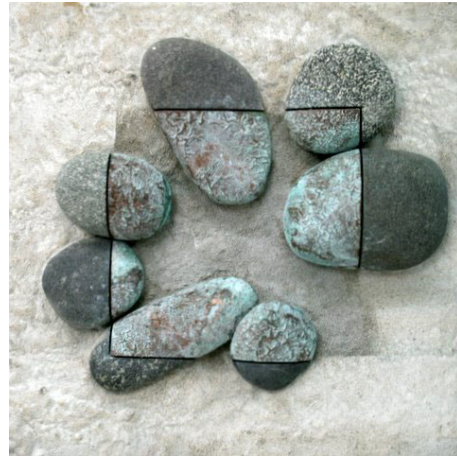
"Window" by David Phillips

The show runs from October 15 to November 27, 2010.