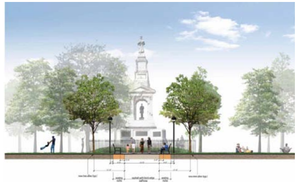
SECTION A: NEW PATH ON AXIS TO CIVIL WAR MONUMENT

A: Residents can show support by attending the public meetings that CDD will host to discuss the project.